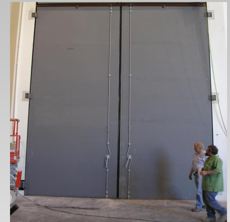
Double Swinging Sound Fire STC 51 Door