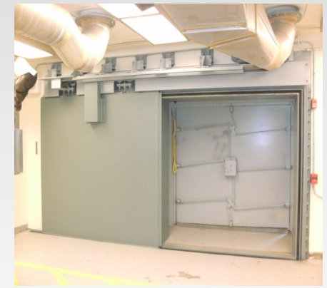
US Army High Explosion Proof Gas Tight Door and Secondary Air Tight Door