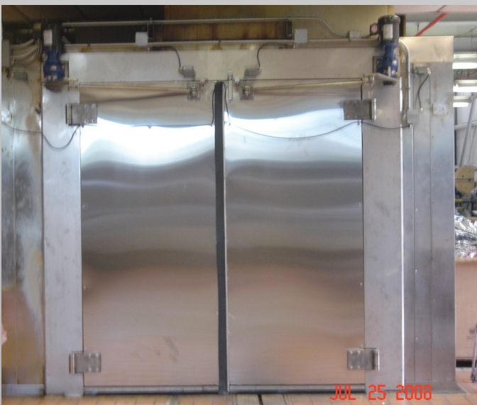
BASF Automotive Paint Test Stainless Steel Explosion Proof Oven Doors