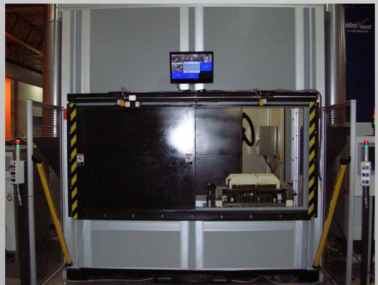
Dual Station with Internal and External Pneumatic Cylinder Laser Booth Doors