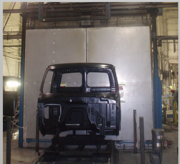
Truck Body 400 Degree Paint Oven Doors