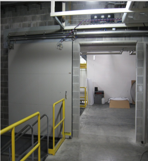
XEROX Explosion Proof Full Pneumatic Sliding Door System