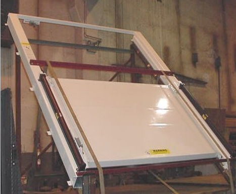
High Production Self Supporting