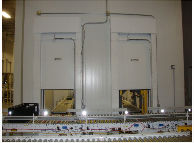
Automotive Battery Manufacturing 5 PSI Pressure Air Tight Production doors