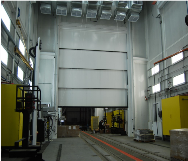
Caterpillar STC 45 Run Test Booths