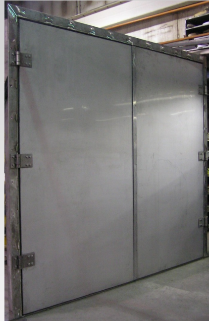
Overseas Stainless Steel Jet Engine Test Cell STC 56 Door