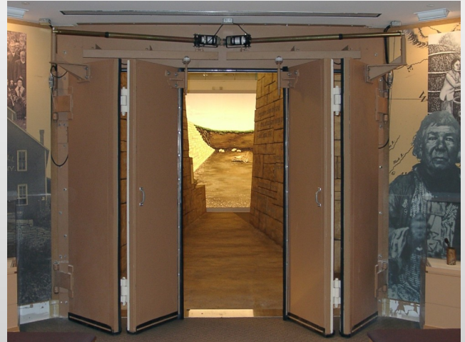
Museum Four Folding