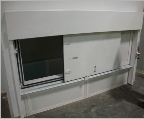
Fire Sliding Pressure/Air Tight