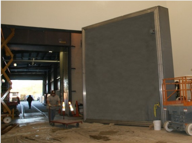
NASA 166,000 lb Swing Door with Pneumatic Seals Tested to 165 db at 35 and 50 Hz