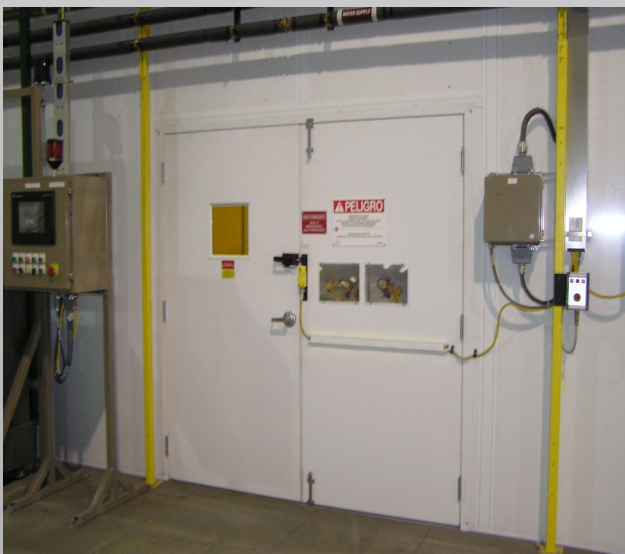
Ford Motor Company Interlocked Weld Cell Door