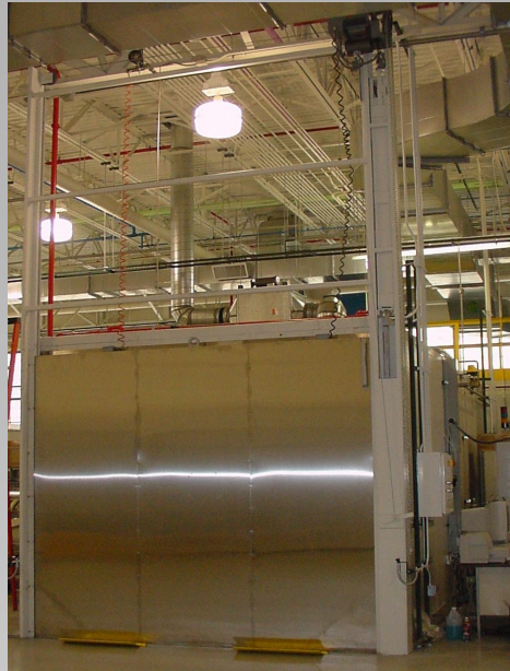
Automotive Emissions Stainless Steel Pneumatically Sealed Door