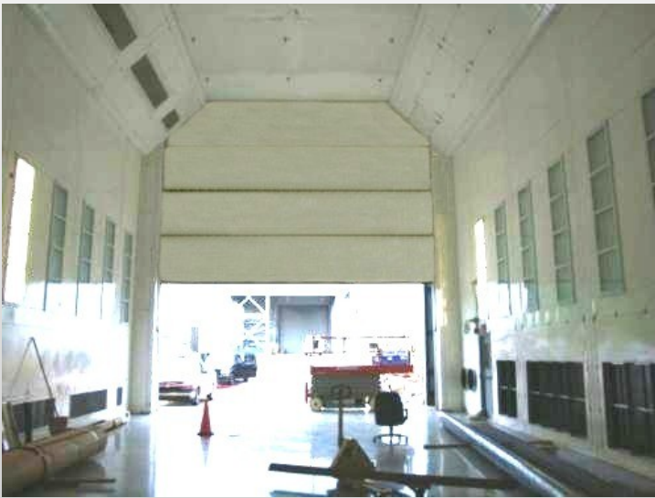
McDonald Douglas Paint Booth Vertical Lift