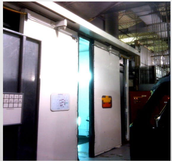
Daimler Truck Bi-Parting Doors