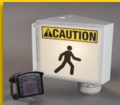
Part No. DM-PED-104-XL Triangular Pedestrian Alert with Motion Sensor / Audible Alarm