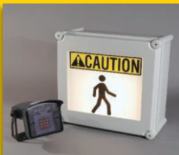
Part No. DM-PED-116-XL Wall Mounted Pedestrian Alert with Motion Sensor

NOTE: Any deviations from the standard system design must be in writing for quote request *Mounting Hardware NOT included