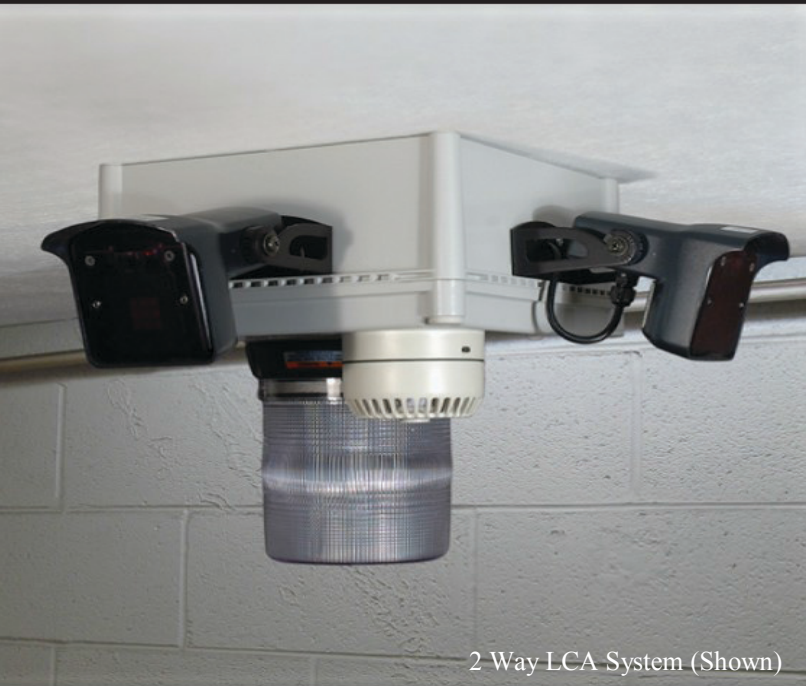
2 Way LCA System (Shown)