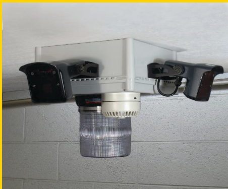
Part No. . DM-LCA-G2-XL 2 Way Caution System (SHOWN)