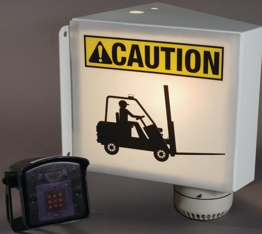
2-Sided Fork Truck Alert with Sensor / Audible Alarm