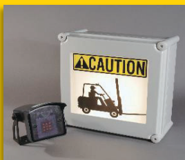
Part No. DM-ELF-208 Triangular Fork Truck Alert with Motion Sensor and Audible Alarm

NOTE: Any deviations from the standard system design must be in writing for quote request *Mounting Hardware NOT included