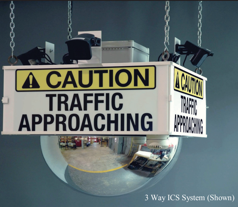
3 Way ICS System (Shown)

Make every effort to alert workers when a fork lift is nearby. Enforce safe driving practices such as obeying speed limits, stopping at signs.