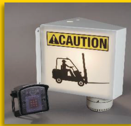
Part No. DM-ELF-220 Wall Mounted Fork Truck Alert with Motion Sensor