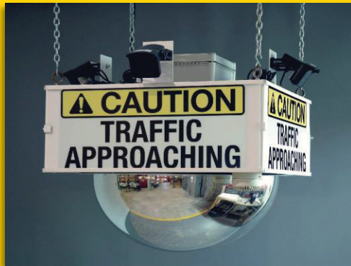
Part No. DM-ICS-G3 3 Way Caution System (SHOWN)