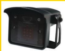
DM-901 / XL