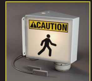
2-Sided Pedestrian Alert with Magnetic Sensor / Audible Alarm