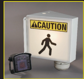
2-Sided Pedestrian Alert with Sensor / Audible Alarm