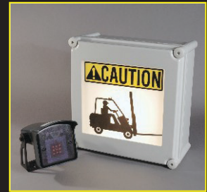
Type 12/13 Fork Truck Alert