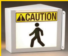
Part No. DM-PED-100 Triangular Pedestrian Alert Slave