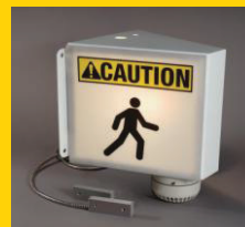
Part No. DM-PED-112 Triangular Pedestrian Alert with Magnetic Sensor, & Audible Alarm