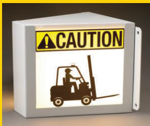
Part No. DM-ELF-200 Triangular Forktruck Alert (slave)